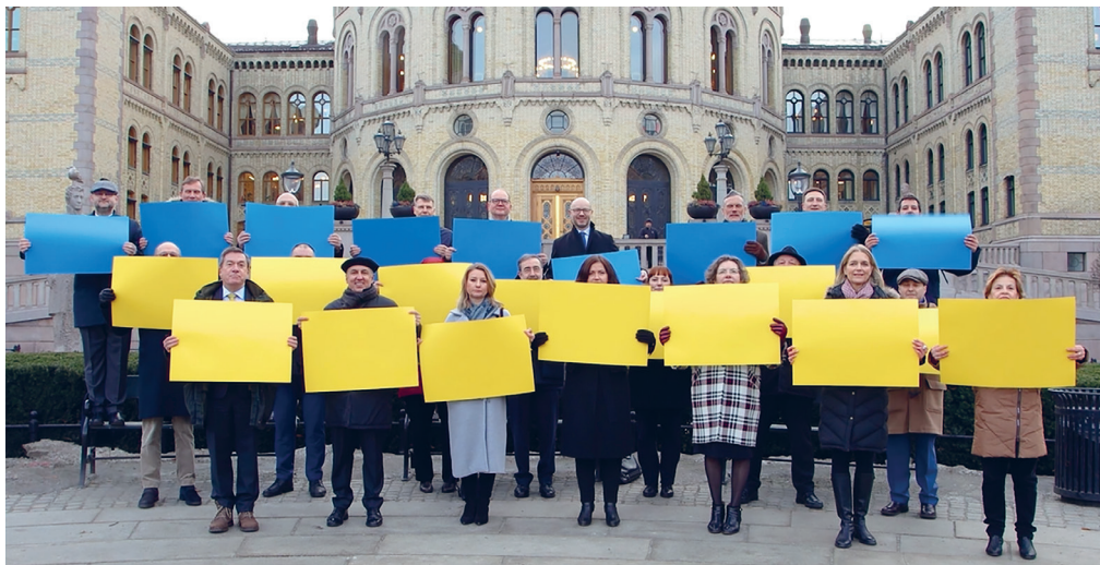
«Solidarity Rally» за участю всіх послів країн ЄС у Норвегії

EU countries' ambassadors to Norway take part in the Solidarity Rally