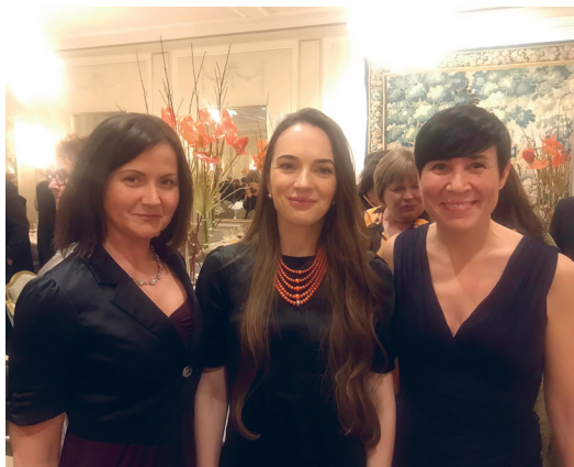
З нобелівською лауреаткою та очільницею Комітету в закордонних справах Стортингу під час вручення Нобелівської премії миру

With Nobel laureate and Chairwoman of the Storting Foreign Affairs Committee at the Nobel Peace Prize award ceremony