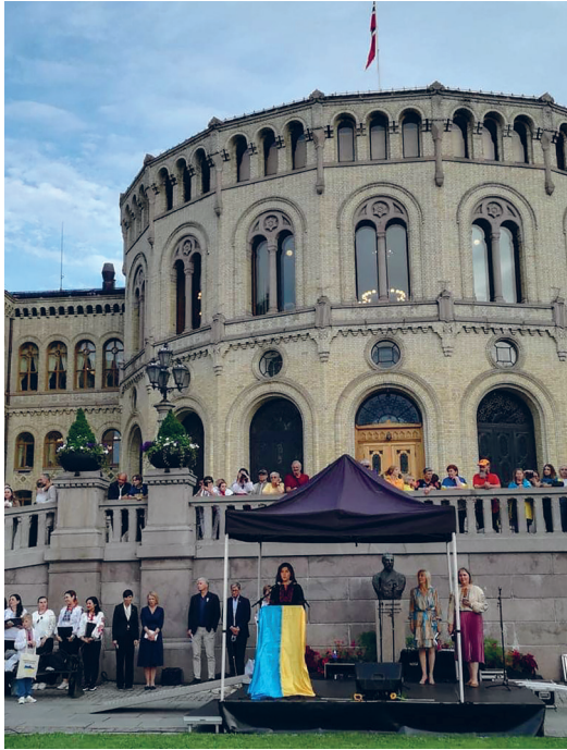
Виступ Тимчасової повіреної з нагоди Дня Незалежності України

Chargé d'Affaires' speech on the occasion of the Independence Day of Ukraine