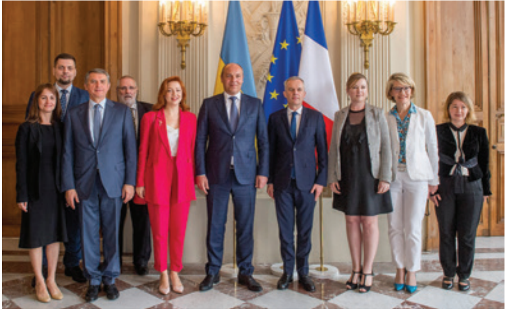
Голова Верховної Ради України А. Парубій та представники групи дружби Україна-Франція під час офіційного візиту до Французької республіки провели зустріч із Головою Національних зборів Франції Франсуа де Ружі. 11.06.2018

Head of the Verkhovna Rada of Ukraine A. Parubii and representatives of the France-Ukraine Friendship Group held the meeting with François de Rugy, President of the National Assembly of France, during the official visit to the French Republic. 11.06.2018