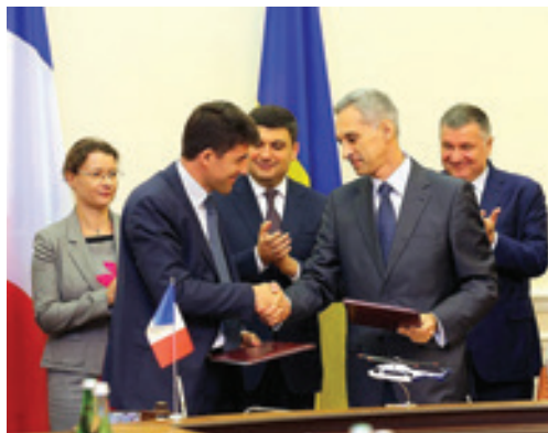
Підписання угоди між урядами України та Франції про купівлю вертольотів Airbus. 14.07.2018

and Finance of France M. Sapin, which became the main event in the field of trade and investment cooperation development over the past 7 years. During the forum, two framework agreements on the transportation and storage of natural gas have been signed between the Ukrainian operator “Ukrtransgaz”, PJSC and ENGIE (France) and its subsidiary company in Ukraine Engie Energy Management Ukraine, LLC. The forum, which was attended by more than 200 business representatives from France, showed, first of all, that the French business circles positively assess the stabilization of the political situation in Ukraine and the improvement of the business climate: they began to intensify cooperation with Ukrainian partners in the field of export and import operations, and in the field of investment in production.