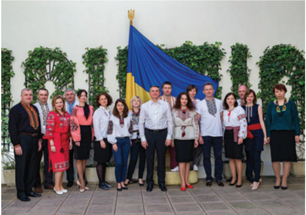
Співробітники посольства України у Франції відзначили День вишиванки. 18.05.2018 Employees of the Embassy of Ukraine in France celebrated the Vyshyvanka Day. 18.05.2018

political prisoners in Russian prisons was at the centre of a rather emotional debate. In the framework of the festival a concert of composer V. Sylvestrov was held on the occasion of his 80 th anniversary celebration. The articles about the festival were published in the French editions “Le Monde”, “Figaro”, “Liberation”, “l’Obs”, “Transfuge”, “Telerama”, and also presented in live broadcasts on radio and TV, namely “TV5Monde”, “France Culture”, “France Inter”.