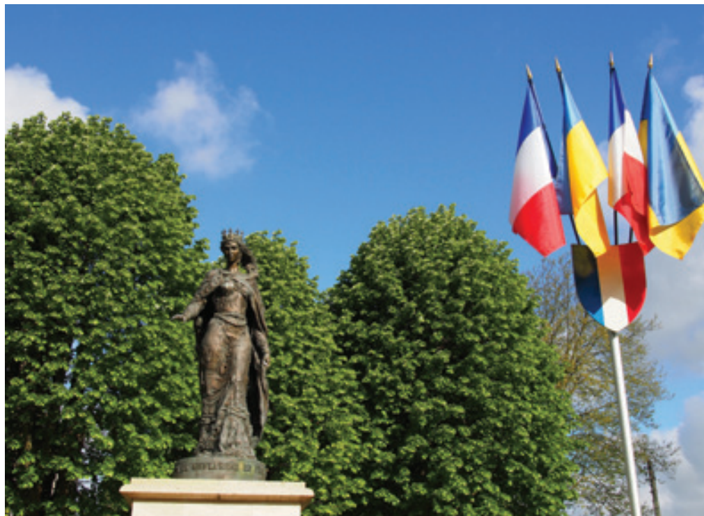
Пам'ятник Анні Ярославні в Санслісі. «Анна Київська, королева Франції» Monument to Anna Yaroslavna in Senlis. "Anne of Kyiv, the Queen of France"

ture to study and create their own masterpieces. Namely, it is the world famous artists Vasyl Kandynskiy and Kazymyr Malevych, Sonia (Terk) Delone, Oleksandra Ekster, Mykhailo Boichuk, sculptor Oleksandr Arkhypenko and many others. Prominent figures of Ukrainian origin lived and worked in France, namely, ballet master Serge Lifar, composers Ihor Stravinsky and Fedir Yakymenko.