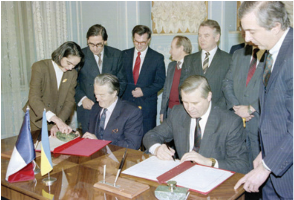
Підписання міжурядового протоколу про встановлення дипломатичних відносин між Україною та Францією. 23 січня 1992 року.

In 1992, a political dialogue on the highest level was also established. Since then it obtained a regular character, however a special dynamics was reached during the last three years. Namely, the bilateral cooperation now has special meaning after the Russian aggression against Ukraine in 2014 when France proclaimed the univocal political support to our country, having condemned the annexation of Crimea and reaffirming the commitment to the sovereignty of our state within its internationally recognized borders. Since the establishment of diplomatic relations, the heads of Ukraine and France have met almost 20 times in various formats, and 11 times of which – during 2015–2018.