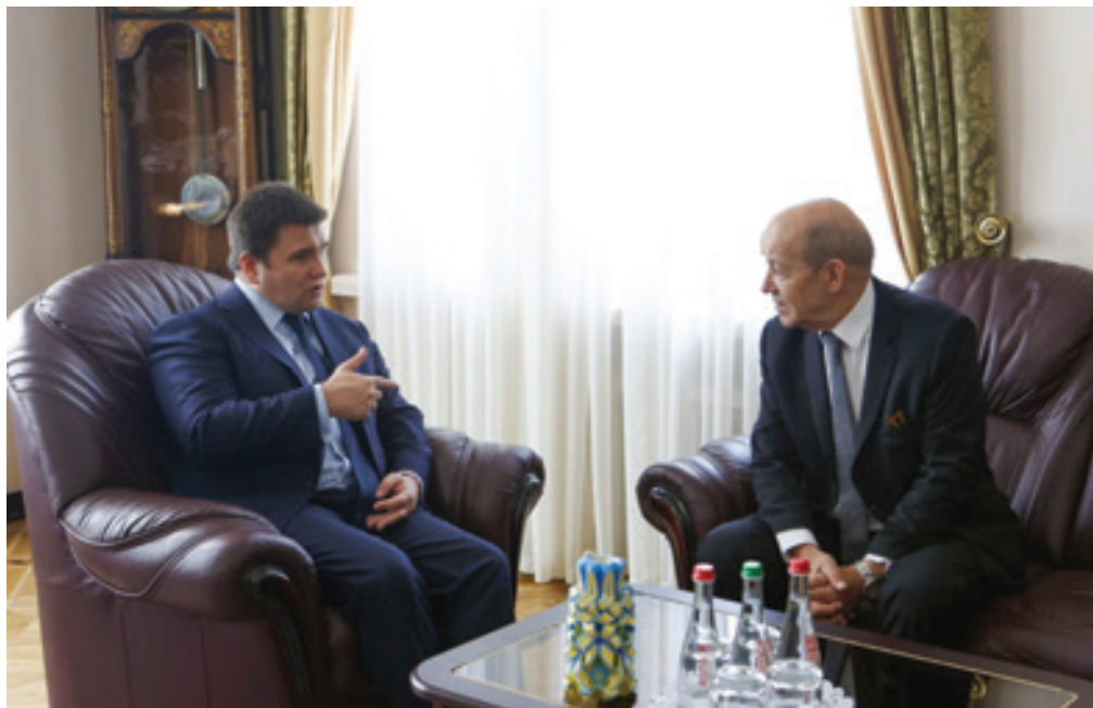
Міністр закордонних справ України Павло Клімкін та міністр у справах Європи і закордонних справ Ж.-І. Ле Дріан під час візиту до Києва. 22.04.2018.

Minister for Foreign Affairs of Ukraine Pavlo Klimkin and Minister of Europe and Foreign Affairs Jean-Yves Le Drian during the visit to Kyiv. 22.04.2018.